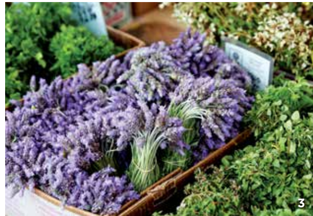
1. Lotusland 2. & 3. Santa Barbara Farmers' Market