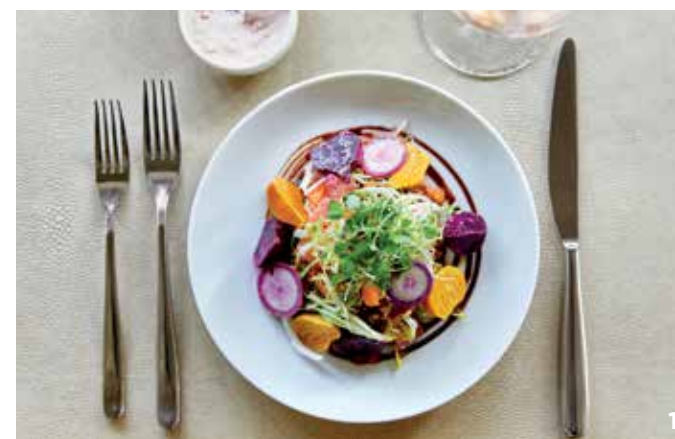
1. Olivers 2. Belmond El Encanto

On the Alley Relaxed and family friendly, try this popular salty-dog fave located near the Santa Barbara Harbor. Kids go nuts for the waffle fingers and burritos with tater tots, and parents can opt for a chopped sesame salmon salad or clam chowder. Sit outside to watch the gently bobbing boats. 117 Harbor Way, onthealley.com